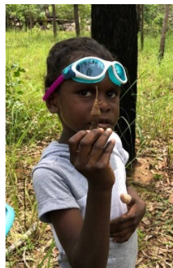
Finding Badju and Karrbilk