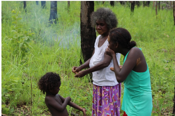
Learning about Kunboy